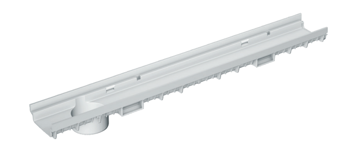
T1460N-PB-BO4 with 4" bottom outlet